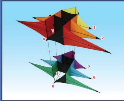
Back of Kite